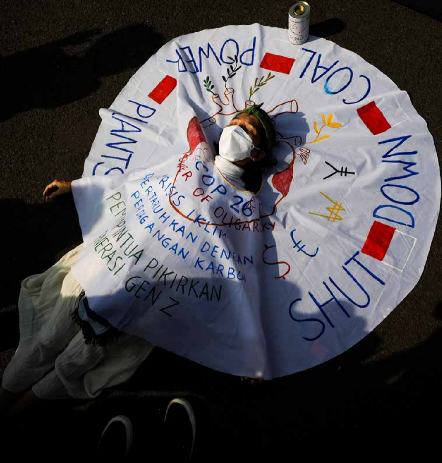
Coal barges are pictured as they queue to be pulled along Mahakam river in Samarinda, East Kalimantan province, Indonesia, August 31, 2019.