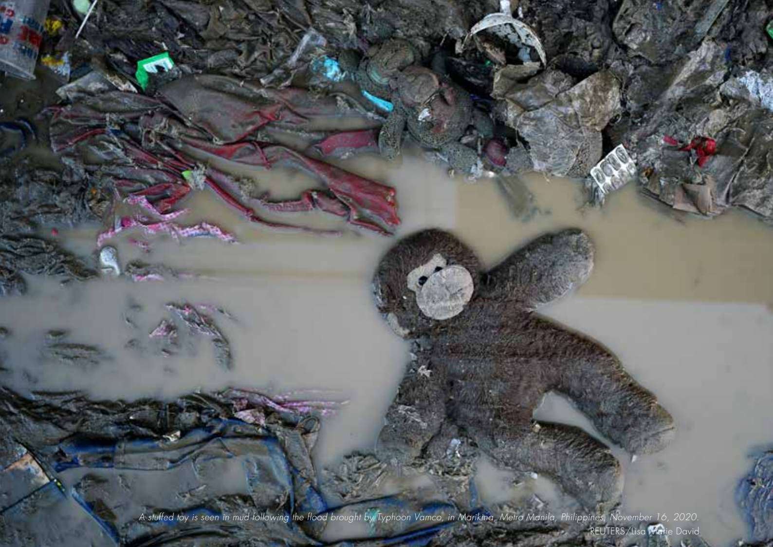
A stuffed toy is seen in mud following the flood brought by Typhoon Vamco, in Marikina, Metro Manila, Philippines, November 16, 2020.