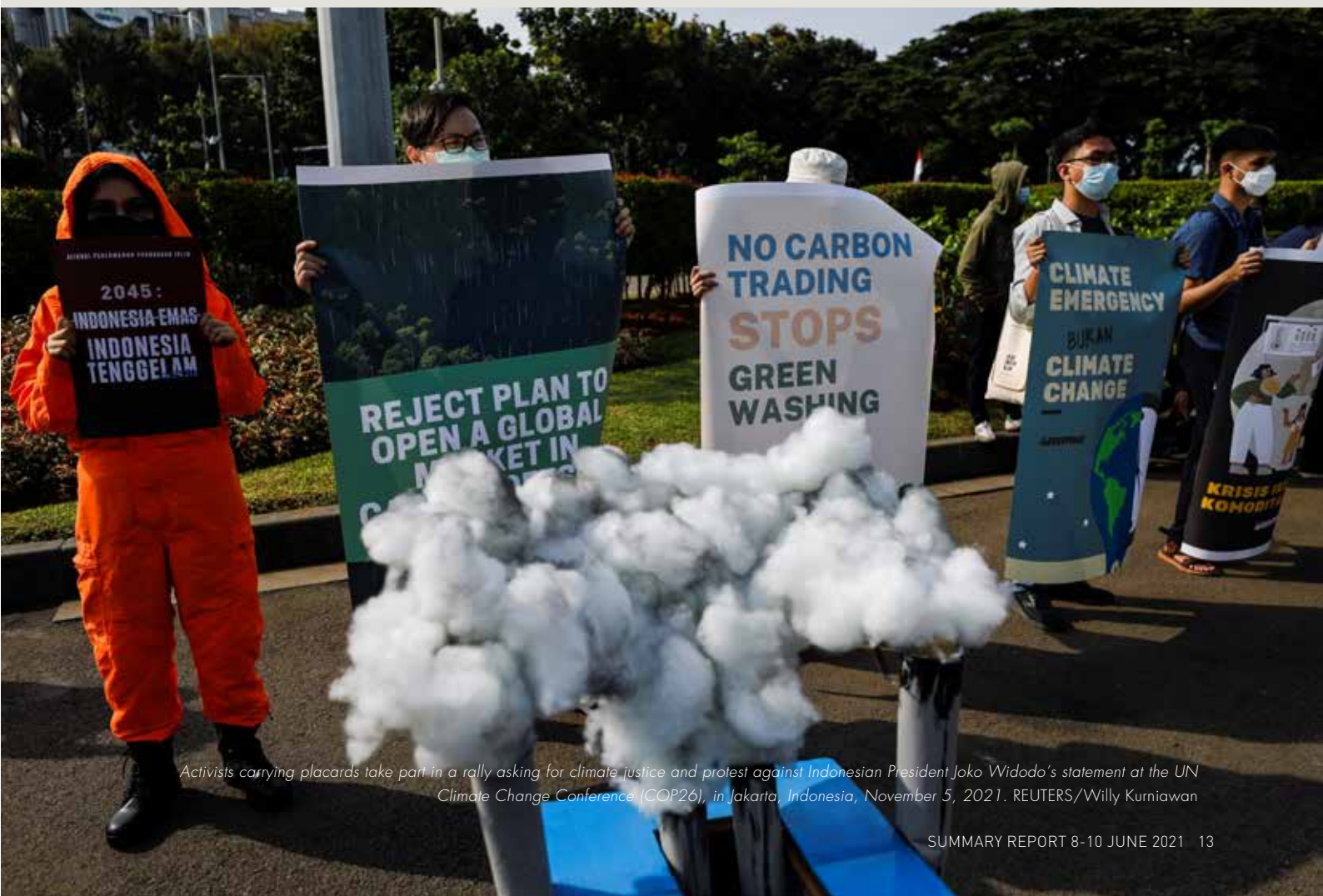
Activists carrying placards take part in a rally asking for climate justice and protest against Indonesian President Joko Widodo's statement at the UN Climate Change Conference (COP26), in Jakarta, Indonesia, November 5, 2021.