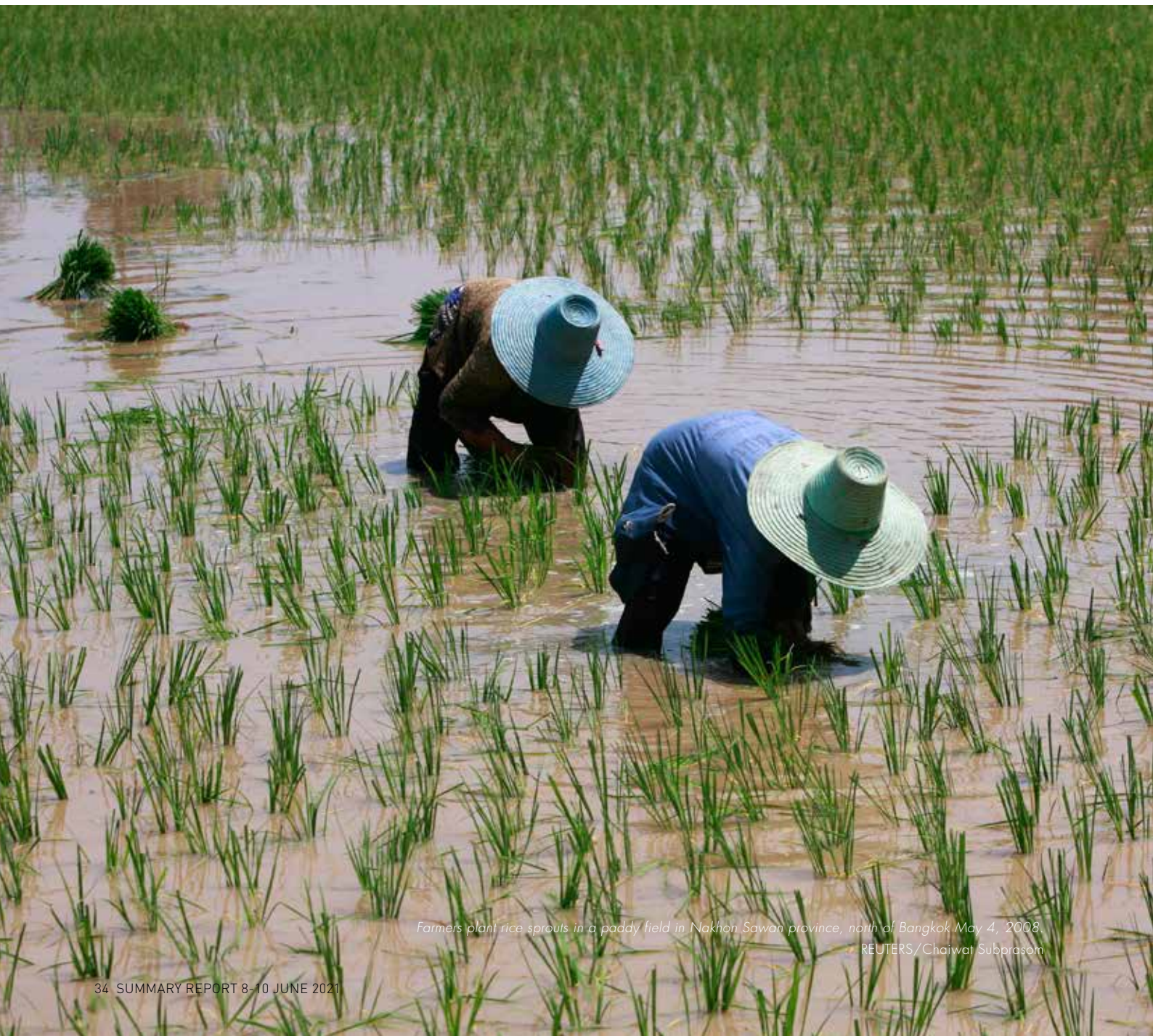
Farmers plant rice sprouts in a paddy field in Nakhon Sawan province, north of Bangkok May 4, 2008.