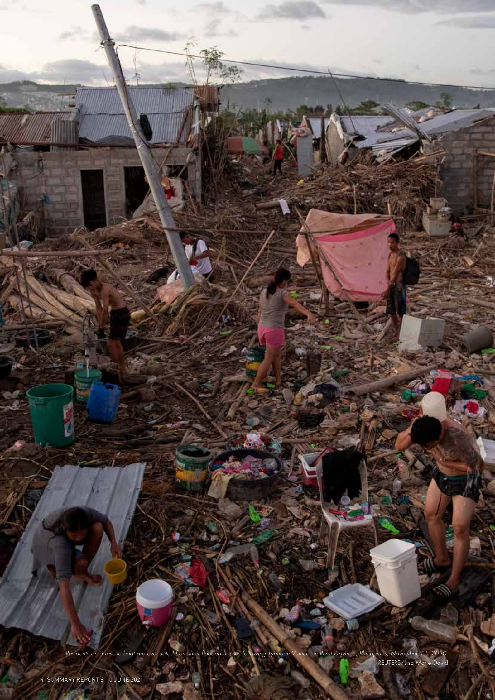
Residents on a rescue boat are evacuated from their flooded houses following Typhoon Vamco, in Rizal Province, Philippines, November 12, 2020.