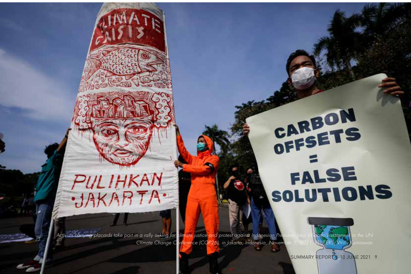
Activists carrying placards take part in a rally asking for climate justice and protest against Indonesian President Joko Widodo's statement at the UN Climate Change Conference (COP26), in Jakarta, Indonesia, November 5, 2021.