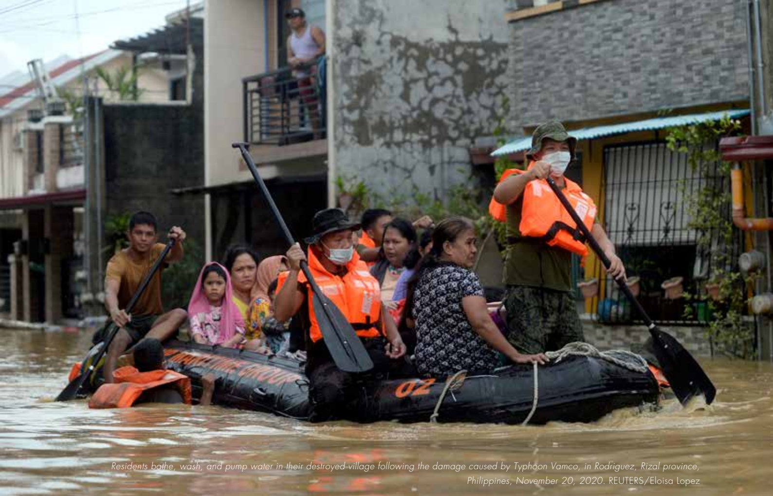
Residents bathe, wash, and pump water in their destroyed village following the damage caused by Typhoon Vamco, in Rodriguez, Rizal province, Philippines, November 20, 2020.