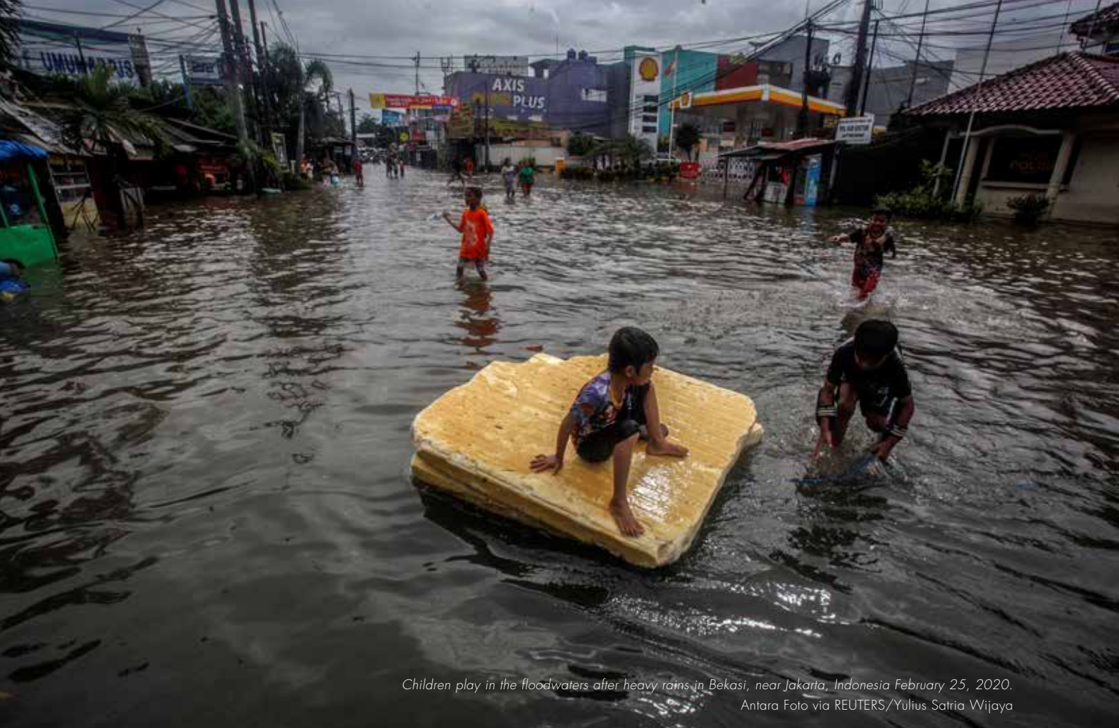
Children play in the floodwaters after heavy rains in Bekasi, near Jakarta, Indonesia February 25, 2020.