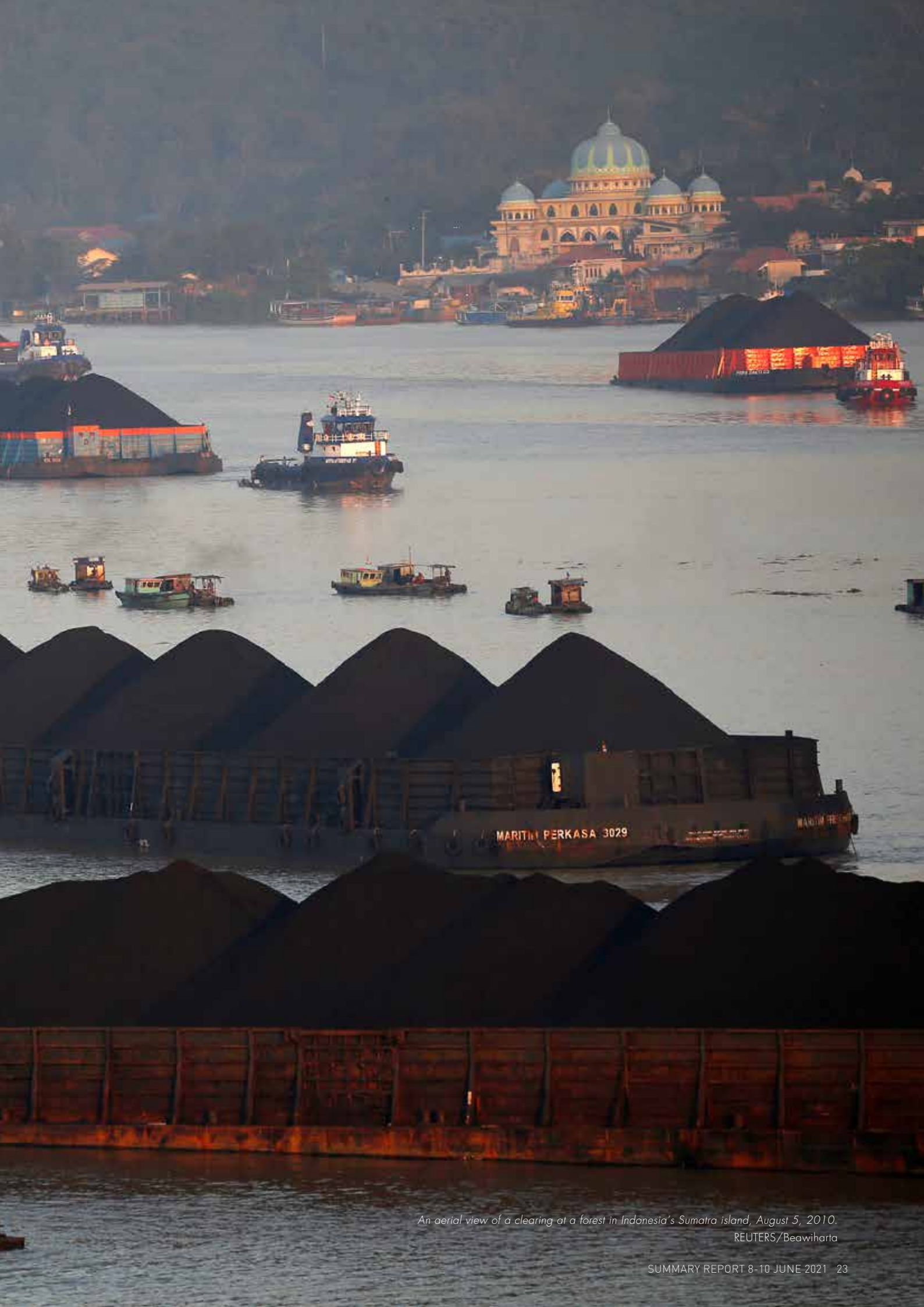
An aerial view of a clearing at a forest in Indonesia's Sumatra island, August 5, 2010.