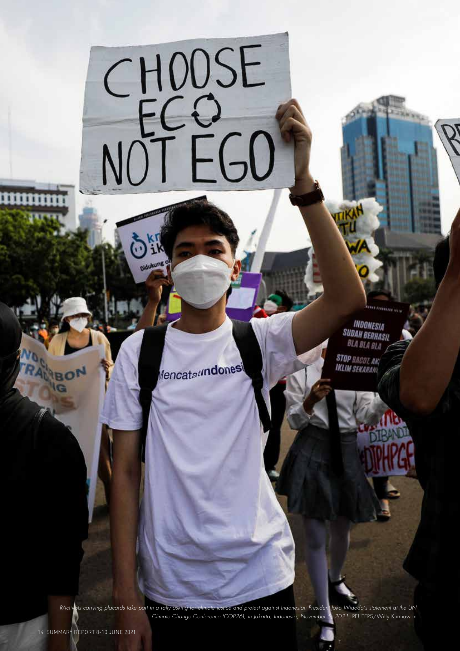
Activists carrying placards take part in a rally asking for climate justice and protest against Indonesian President Joko Widodo's statement at the UN Climate Change Conference (COP26), in Jakarta, Indonesia, November 5, 2021.